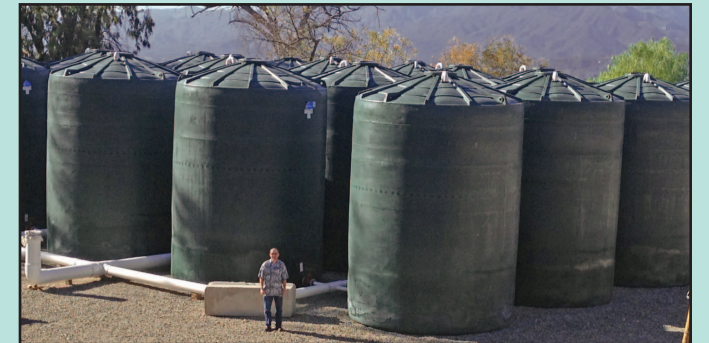
Neil Cole, Principal Civil Engineer stands in front of 16 temporary water tanks to be used during work on Upper Ojai Reservoir tank.

How do you complete work on the only water tank in a service area and keep customers happy by keeping their water running? Casitas' answer is to use temporary water tanks! Casitas is planning to avoid any interruption in water service to customers in the Upper Ojai Valley while completing interior painting and seismic improvements on the Upper Ojai Reservoir tank. The temporary water tanks will provide the necessary water storage during the work. After this work is complete, the temporary tanks will be used during future reservoir maintenance activities.