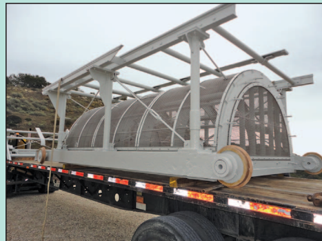
Newly refurbished intake gate assembly arriving ready to be returned to service.