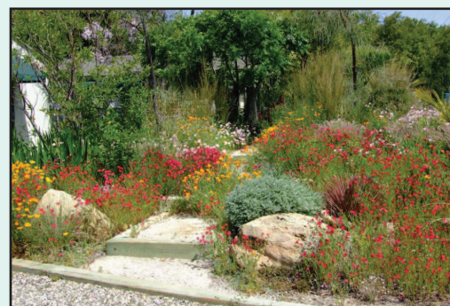
Landscape design on website courtesy of GardenSoft.