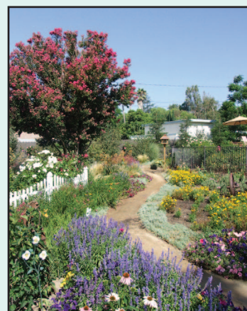
Landscape design from the Ventura County Water Wise Gardening website, courtesy of GardenSoft.