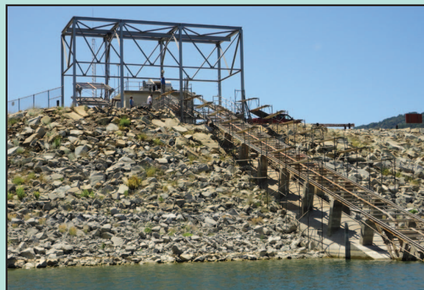
Setting up scaffolding for recoating of dam's hoist house equipment and intake track.